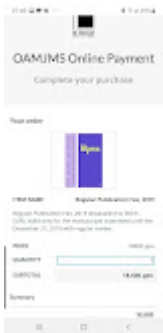
WhatsApp Image 2020-03-01 at 07.48.21.jpeg 41K